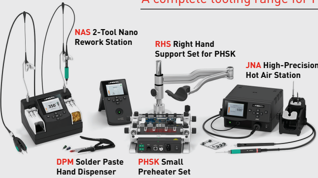
NAS 2-Tool Nano Rework Station

A complete tooling range for High Precision