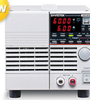
PLR-Series Low Noise DC Power Supply