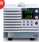
PSW-Series Programmable Switching DC Power Supply