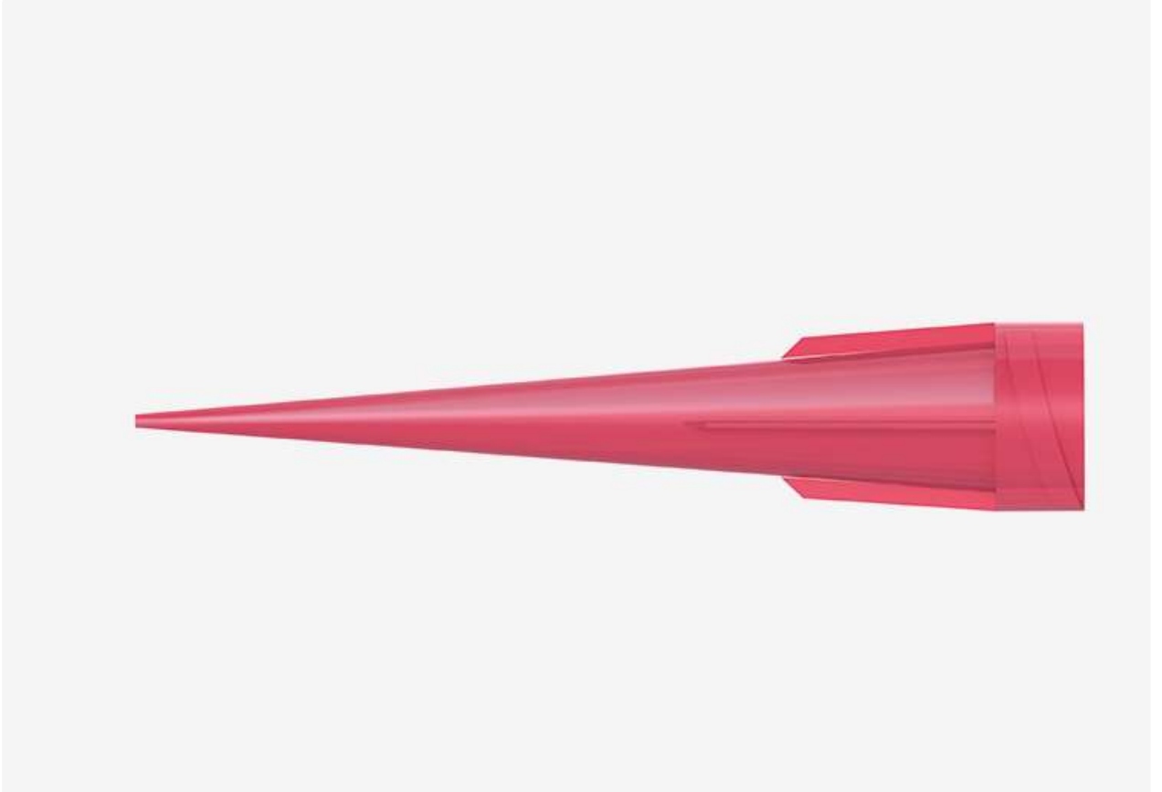
ND27P ØID 0.20 mm / 0.008 in