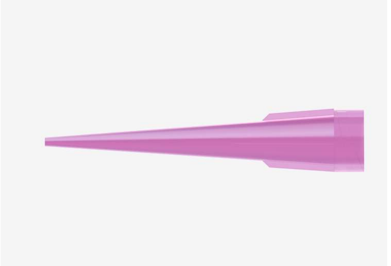
ND22P ØID 0.41 mm / 0.016 in