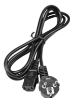
Mains cable 230 V (IEC C13 plug)