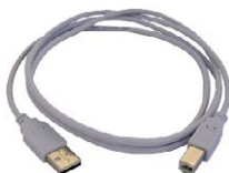
USB cable only for • SRP-50k0-5T0 • SRP-50k0-10G0 • SRP-50k0-100G0