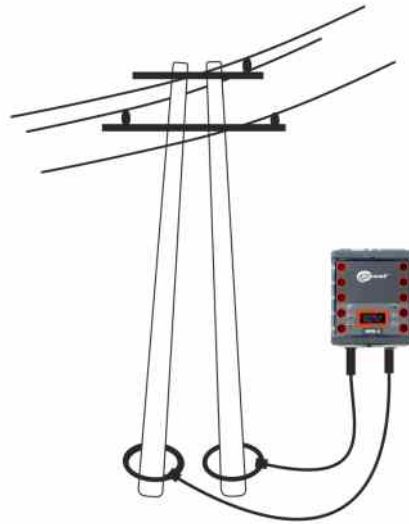
Pic.2 Device working with two clamps.