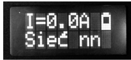
Pic.4 Work in low voltage mode – value of current measured with the clamp and battery level can be seen on the screen.