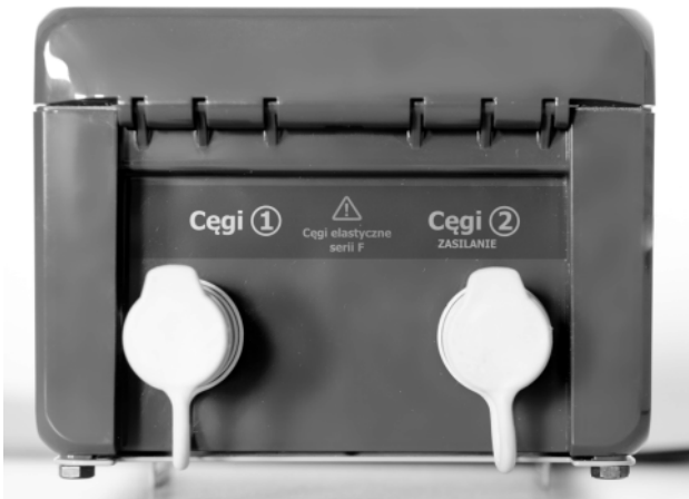
Pic.5 Inputs in MPU-1 signaler.