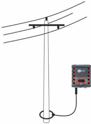
Pic.1 Device working with single clamp.

The device shall be connected to measured power network or device according to the pictures below: