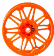
Test wire reel