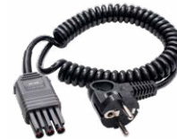
WS-04 adapter with UNI-SCHUKO angular plug