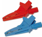
Crocodile clip 1 kV 20 A red /blue