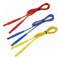
Test lead 1.2 m (banana plugs) red / blue / yellow