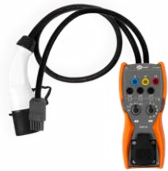
EVSE-01 adapter for testing vehicle charging stations