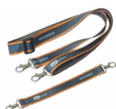
L2 hanging straps (set)