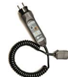
WS-03 adapter with START button with UNI-Schuko plug (CAT III 300 V)