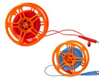
Test lead for earth resistance measurement 25 m red / blue