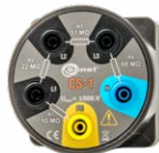
CS-1 cable simulator