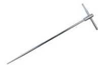
Earth contact test probe 80 cm