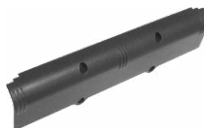
Battery pack 4xLR14