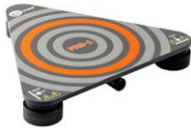
PRS-1 resistance test probe