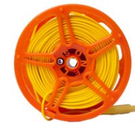
Test lead for earth resistance mea- surement 50 m