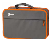
L2 carrying case