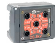
CS-5kV cali- bration box