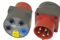
Three-phase socket adapter 16 A / 32 A