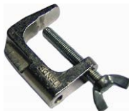
Cramp with banana socket