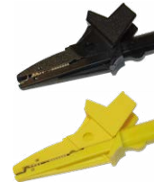
Crocodile clip 1 kV 20 A black / yellow