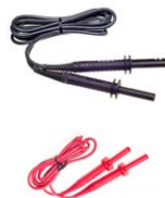
Test lead 5 kV 1.8 m (banana plugs) black shielded / red