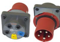
Three-phase socket adapter 63 A