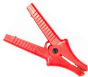
red "crocodile" clip 11 kV 32 A WAKRORE32K09