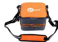
M-8 carrying case WAFUTM8