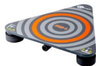
PRS-1 resistance test probe WASONPRS1