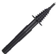
test probe with banana socket; 5 kV; black WASONBLOGB2