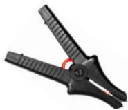
black "crocodile" clip 11 kV 32 A WAKROBL32K09