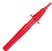
test probe with banana socket; 5 kV; red WASONREOGB2