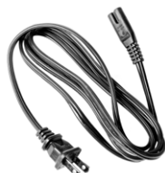
125 V power cord (IEC C7 plug) WAPRZLAD230US