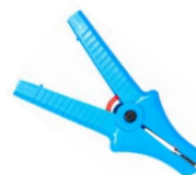
blue "crocodile" clip 11 kV 32 A WAKROBU32K09