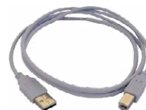
USB cable WAPRZUSB