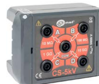
CS-5kV calibration box WAADACS5KV