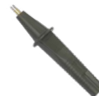
2x double-tip Kelvin probe (banana sockets)