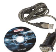
RS-232 serial transmission cable