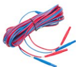
Double-wire test lead (10 A / 25 A) U1/I1 6 m / 10 m / 15 m

WAPRZ006DZBBU111 WAPRZ010DZBBU111 WAPRZ015DZBBU111