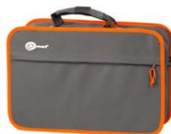
L1 carrying case